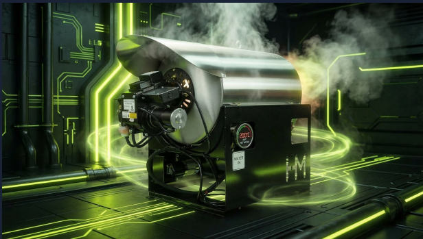
BECKETT OIL BURNER 200°F+ Hot Water · Double Hot Only