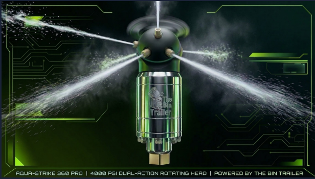
AQUA-STRIKE 360 PRO | 4000 PSI DUAL-ACTION ROTATING HEAD | POWERED BY THE BIN TRAILER