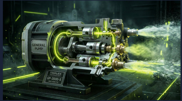
GENERAL PUMP TRIPLEX 5-Year Warranty · Made in USA